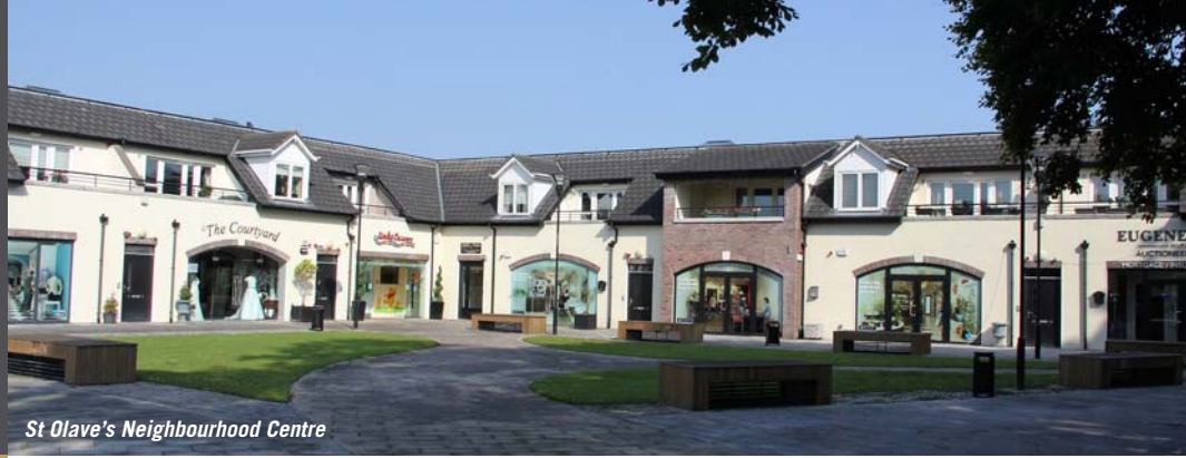
St Olave's Neighbourhood Centre