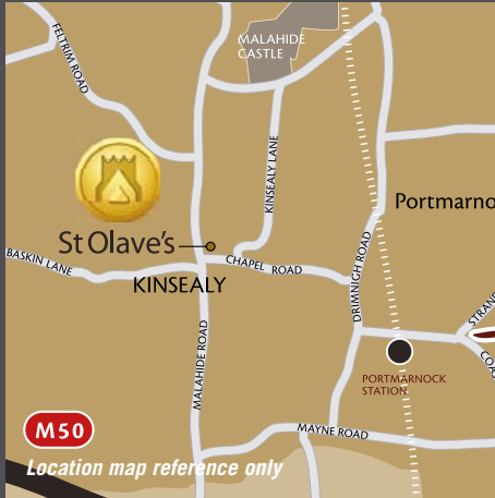
Location map reference only