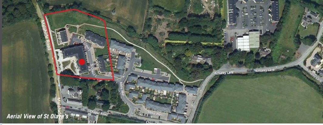
Aerial View of St Olave's