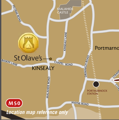
Location map reference only