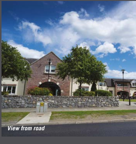
View from road