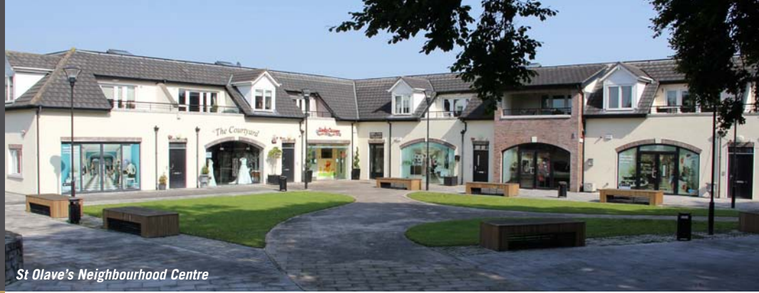
St Olave's Neighbourhood Centre